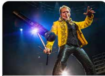
DAVID LEE ROTH