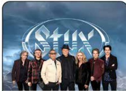
STYX JUNE 19