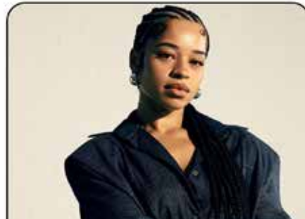
ELLA MAI JULY 2