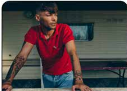
LOUIS TOMLINSON JUNE 26