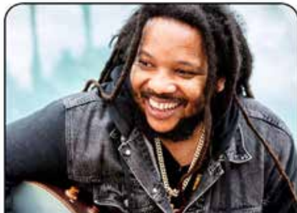
STEPHEN MARLEY JULY 3