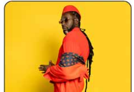
BUJU BANTON JULY 3