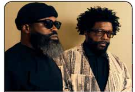
THE ROOTS JUNE 25