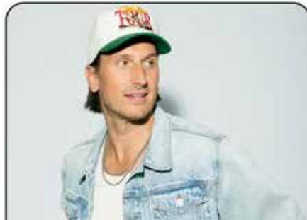
RUSSELL DICKERSON JUNE 27