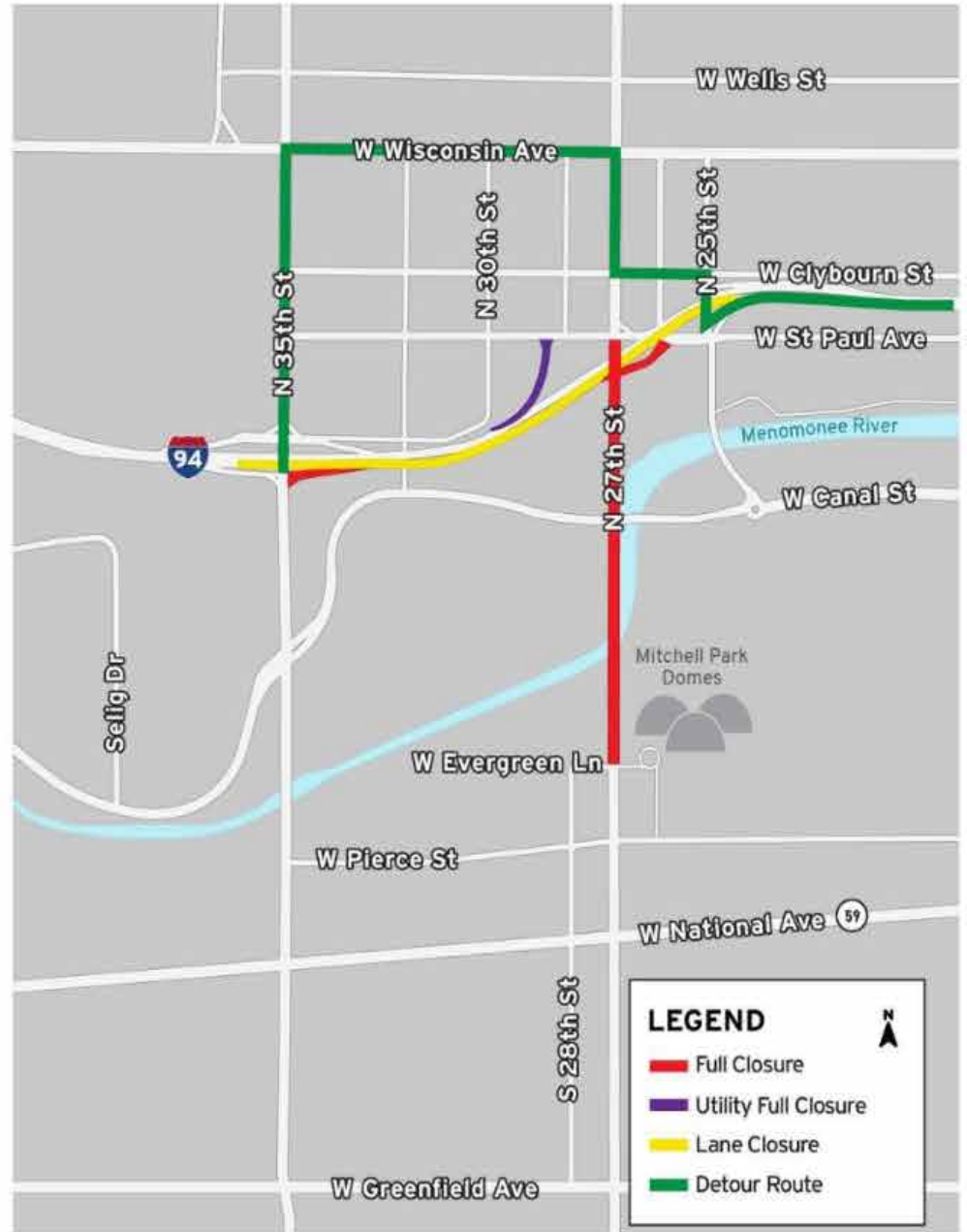
map not to scale

All work is weather dependent and subject to change.