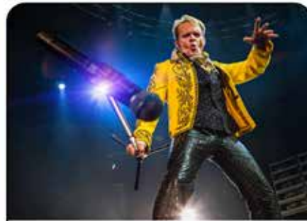
DAVID LEE ROTH JUNE 20